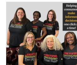
Welcome to the first edition of the Quality Corner with MHCC!

Health care quality is a rapidly growing field to help improve healthcare through measurement, transparency, and accountability. Our team of dedicated quality professionals focuses on public reporting, quality improvement initiatives, and many other exciting projects. We hope this newsletter gives you some insight into the many types of work we do and keeps you up to date on all the latest in health care quality in Maryland.