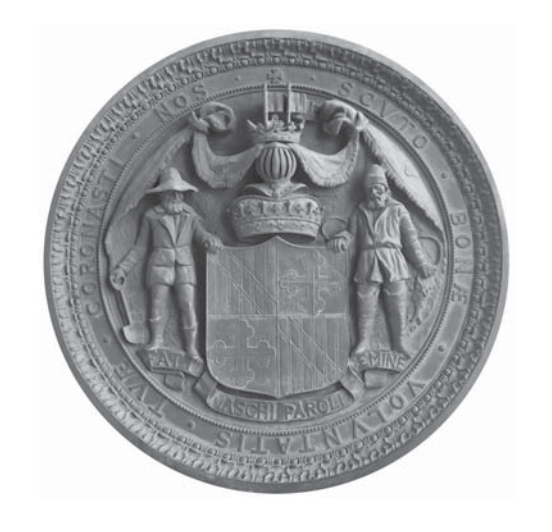
Joint Chairmen's Report Annapolis, Maryland 2014 Session

by the Chairmen of the Senate Budget and Taxation Committee and House Appropriations Committee